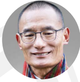
Tshering Tobgay - The Hon'ble Prime Minister of Bhutan