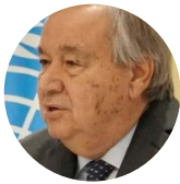
Antonio Guterres - United Nations Secretary-General

... We will hear from UN officials and government representatives: