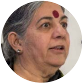
Vandana Shiva - Environmental thinker, Activist, Philosopher of Science, Writer, Science Policy Advocate