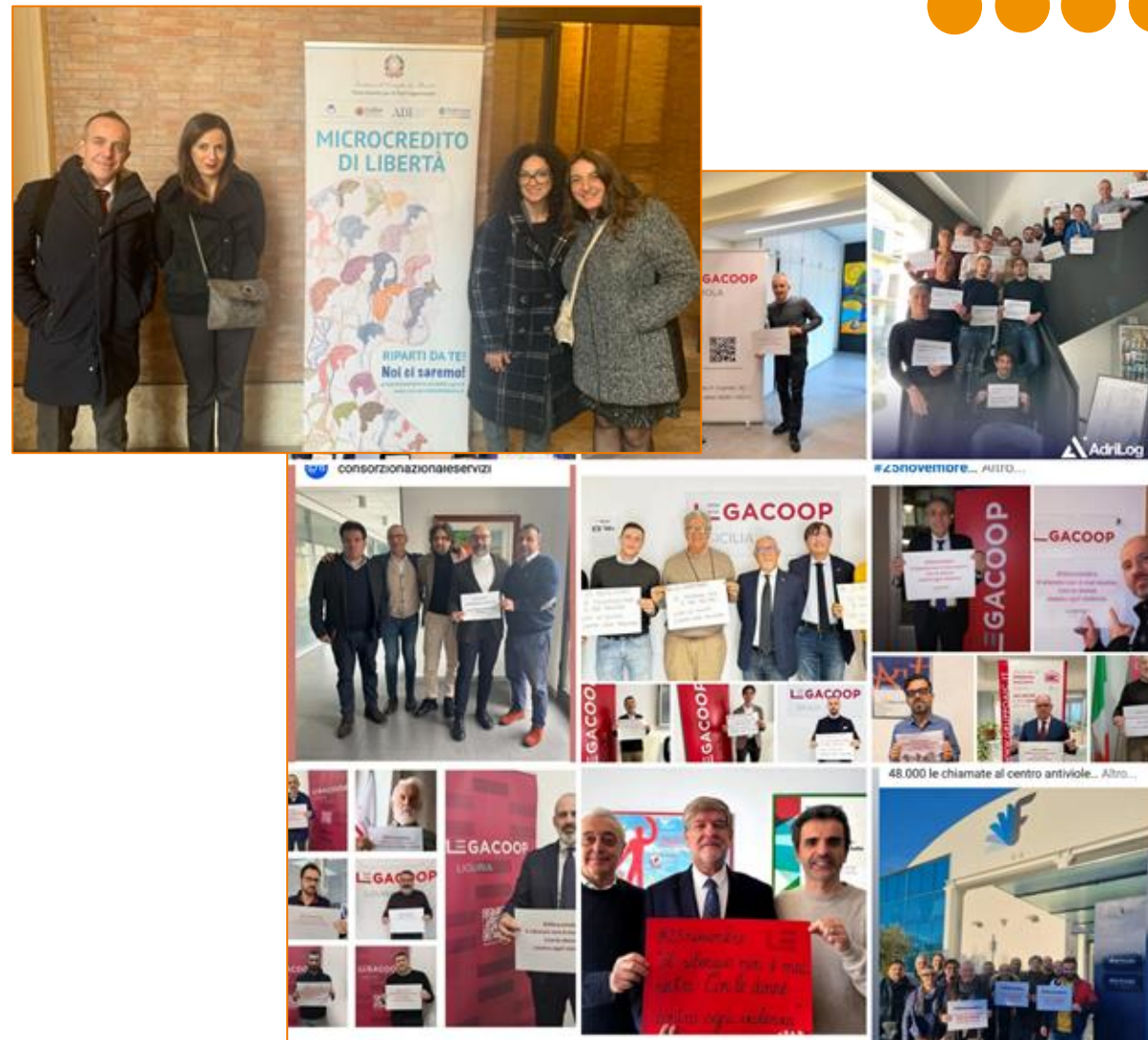
Pictures from the campaign «Silence is never neutral», with the participation of men